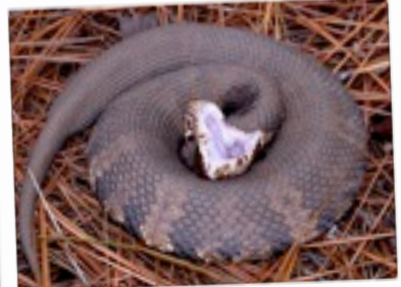
Cottonmouth or water moccasin