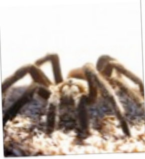
Texas Brown Tarantula